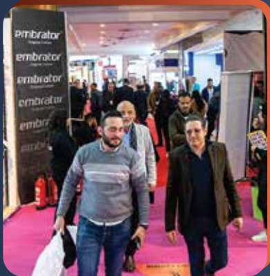
PHOTO GALLERY SAUDI FASHIONTEX