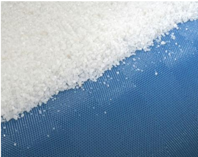
Picture 8: In the food and beverage industry, woven solutions from GKD take on key functions in cooking oil filtration, food production and fruit juice production.