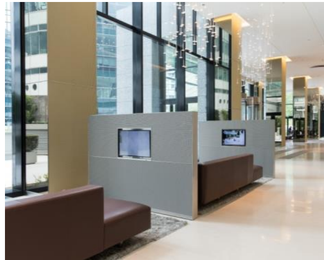
Picture 9: The Tour Europlaza in Paris shows the aacoustical building optimization from metal mesh systems from GKD.