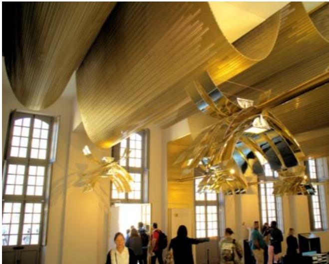
Picture 10: With the Pavillon Dufour at the Palace of Versailles, one of the most prominent projects in company history of GKD was completed in 2016.