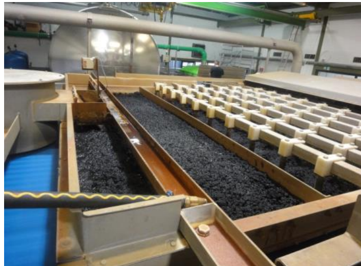
Picture 5: Process belts from GKD are established standard in belt presses for sewage sludge disposal.