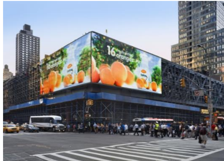
Picture 11: In the MEDIAMESH® transparent media façade system, at the Port Authority Bus Terminal in New York, GKD combines visually aesthetic and ecological product properties with the possibilities offered by state-of-the-art digital media.