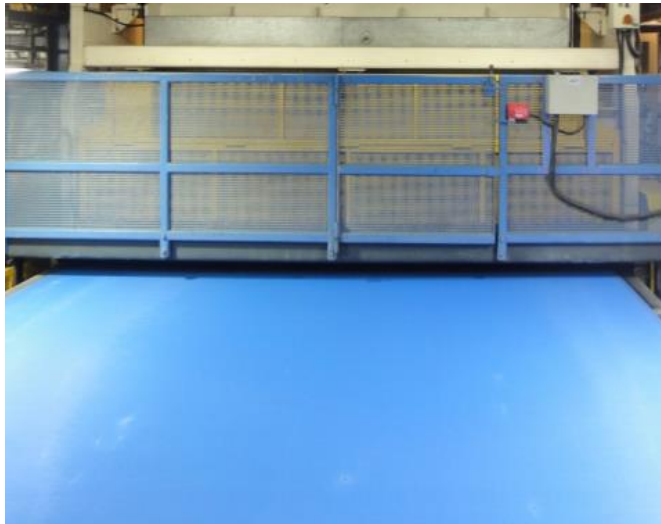
Picture 6: In various applications of the production of hygiene products, process belts from GKD are used.