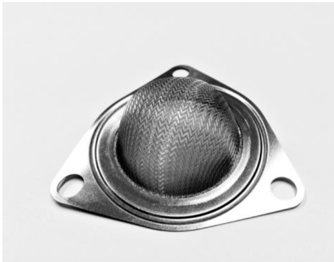
Picture 4: Leading companies worldwide from the automotive industry trust on the decades of problem-solving expertise of GKD.